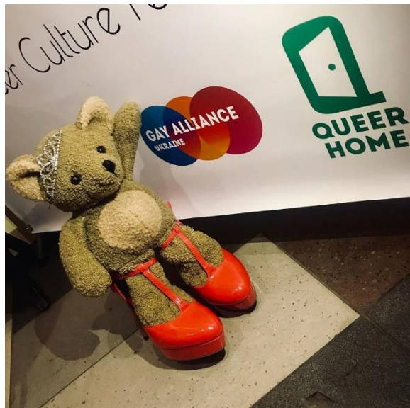
Photo: Queer Home Kryvbas mascot