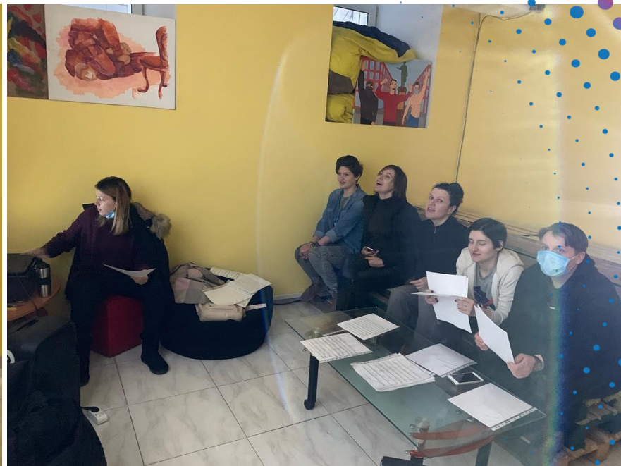
Photo: on the Vocal School lesson