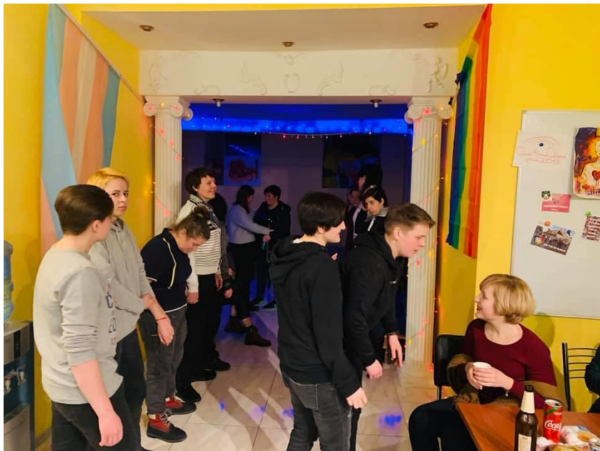
Photo: after the concert part of the Music Evening