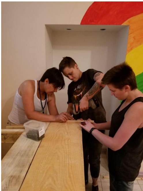
Photo: Making the bar counter